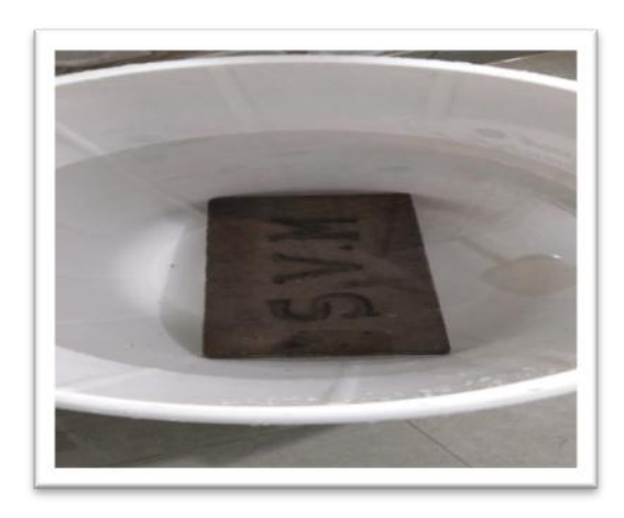
Fig No.4: Water Absorption Test