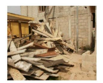
a) Dismantled formwork boards

A great deal of studies have been embraced concerning the wastage of materials on building destinations. A portion of the materials that are squandered on the building locales incorporate steel support, concrete, structure work, blocks, concrete, mortar, tiles, pipe, aggregate.