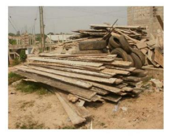
d) Pieces on timber left on site to decay