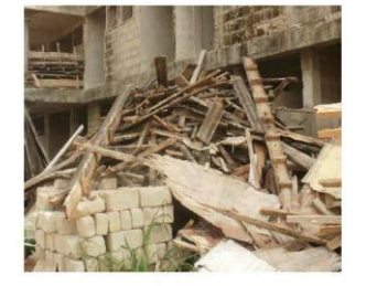
b) Dismantled formwork left on site