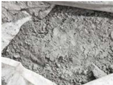
Fig. 4. Cement

Cement is a binder, a substance used for construction that sets, hardens, and adheres to alternative materials to bind them together. Cement is rarely used on its own, however rather to bind sand and gravel (aggregate) along, Cement mixed with fine mixture produces mortar for masonry, or with sand and gravel, produces concrete. Concrete is the most widely used material existing and is behind only water because the planet's most consumed resource.