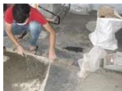
Fig. 5. Mixing of concrete

Dry mixing of fine aggregates and cement, addition of coarse aggregate and steel slag with the correct proportion, addition of m-sand and quarry, addition of calculated water in batch till consistency is achieved.