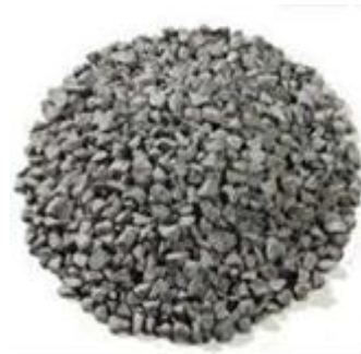
Fig. 3. Course aggregate

Coarse aggregates are irregular broken stone or naturally occurring rounded gravel used for preparing concrete. Materials that are large to be retained on 4.75 mm sieve size are referred to as coarse aggregates, and its maximum size will be up to 63 mm. They must be washed well before using in concrete. Aggregate is one amongst the foremost vital part components of the concrete. Coarse Aggregates offers volume to the Concrete. Coarse aggregates are used in every Construction projects which includes the development of roads, Buildings, Railway Tracks etc.