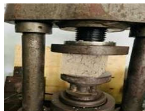
Fig. 9. Failure/breakdown of specimen

8) The loading must be applied axially on specimen without any shock.