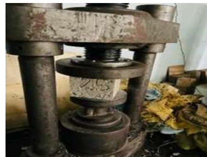
Fig. 8. Aligned specimen on CTM