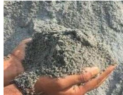
Fig. 2. M-Sand

Manufactured Sand (M-Sand) is sand made from exhausting granite stone by crushing. The crushed sand is of cube like form with grounded edges. It is then washed and ranked with consistency to be used as a substitute of river sand as a construction material. Factory-made sand is an alternate for river sand, because of quick growing industry, the demand for sand has raise hugely, causing deficiency of appropriate river sand in most part of the globe.