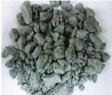
Fig. 1. Steel slag

Steel slag can normally be obtained from slag processors who collect the slag from steel-making facilities. Slag processors may handle a variety of materials such as steel slag, ladle slag, pit slag, and used refractory material to recover steel metallic. These materials must be source separated, and well-defined handling practices must be in place to avoid contamination of the steel slag aggregate. The slag processor must also be aware of the general aggregate requirements of the end user.