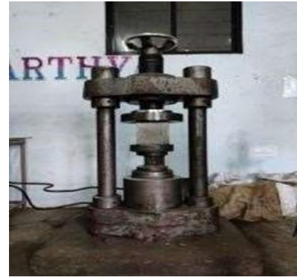
Fig. 7. Specimen placed on CTM