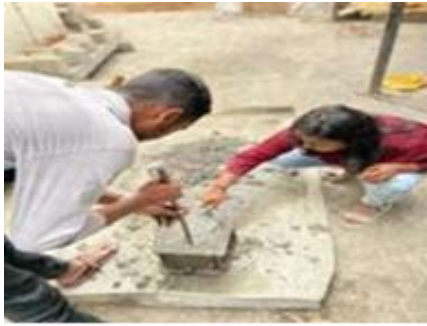
Fig. 6. Casting of Specimen