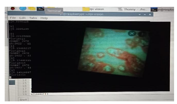
IN IOT PAGE Fig no 4: Psoriasis skin diseases: