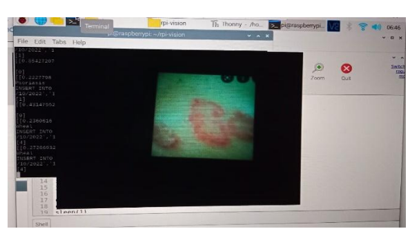
Fig no 6: IoT page output: