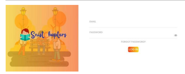
Fig 2.1 Login page

Volume: 09 Issue: 06 | June 2022 www.irjet.net p-ISSN: 2395-0072