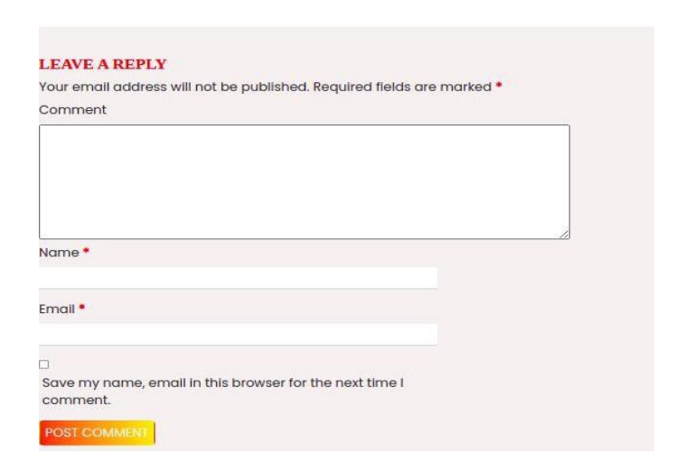
Fig 2.2 A Student Blog

I am currently pursuing bachelor degree in computer science. The quality of teaching is excellent, faculty members are skilled in different domain. And along with theoretical knowledge, practical knowledge is provided to student like hands on project, assignments, etc. The courses are designed by industry experts and are up to date. Course structure consist of all newly booming technology knowledge.