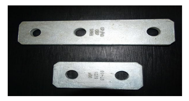
Common Materials in Closed Die Forging

related to both heat transfer and deformation shall be determined. The material parameters commonly used to model heat transfer are the thermal conductivity, heat capacity, and emissivity of the workpiece and mold material. These parameters are usually set based on the temperature and yield stress of the workpiece. Very important for accurate prediction of metal melting behaviour. It is usually defined in terms of strain, strain rate, temperature, and any initial microstructure. Young's modulus, Poisson ratio as a function of temperature and thermal expansion of matrix materials are important parameters for matrix stress analysis