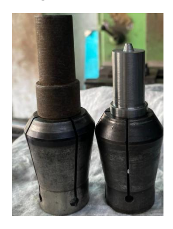
Fig.1: FSP Tools With and without pin

The machine used for friction stir processing was a conventional vertical milling machine which was transformed into a friction stir welding machine and friction stir processing machine by designing a fixture that makes the milling machine capable of performing friction stir welding and friction stir processing. The fixture was fitted on the milling machine table. Two types of tools were used for this process the first tool without pin, and the second tool used for processing was with pin. The tool has a shoulder diameter of 20 mm and a tapered pin of 3-6 mm diameter of a height of 4.5mm as shown in figure 1.