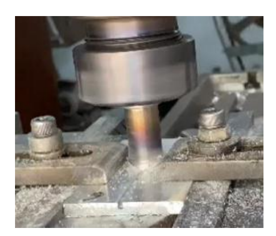
Fig.5: FSP Process without pin