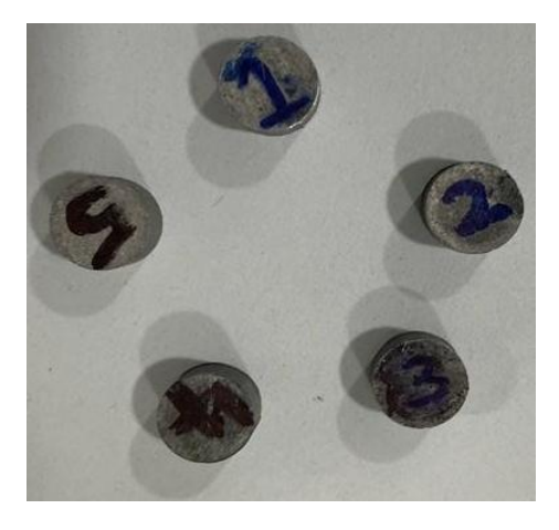
Fig. 9: Wear Test Specimens

distance 502.655 mm and sliding velocity is 1.0472m/s are considered. Wear Test results are tabulated as shown in Table 2.