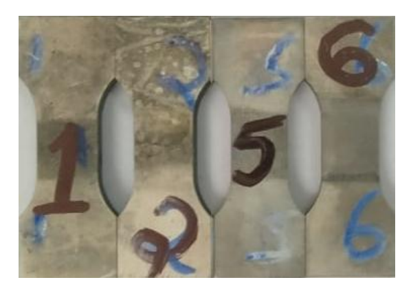
Fig.8: Tensile Test Specimens

The tensile test specimens are e fabricated as per ASTM-E8-2013 standards using Wire EDM as shown in figure 8. The test was conducted on UTM MCS/UTE-20T machine of column clearance 500 mm and Capacity of 200KN. The tensile test results are tabulated in table 1. The wear resistance specimens are fabricated as shown in figure 9. Specimens are circular shape of 12 mm diameter.