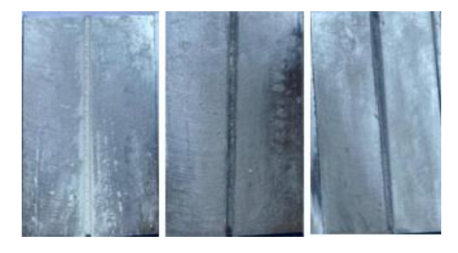
Fig.4: Specimens with reinforcement

The grooves are filled using powders. The three plates arefilled with 15% volume of TiO<sub>2</sub>, 15% volume of SiC and 15% volume of TiO_2 +SiC respectively as sown in figure 4.