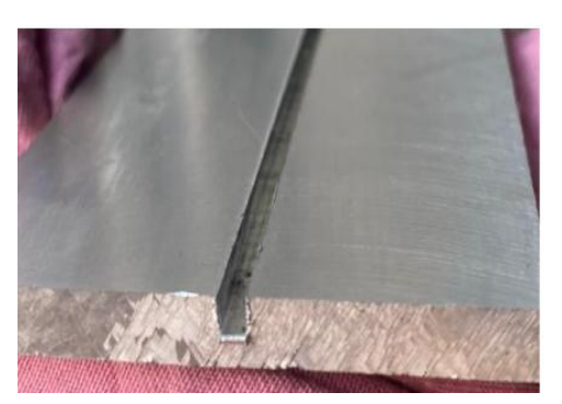
Fig.3: Groove of 100X2X4 mm

The grooves are filled using powders. The three plates arefilled with 15% volume of TiO<sub>2</sub>, 15% volume of SiC and 15% volume of TiO_2 +SiC respectively as sown in figure 4.