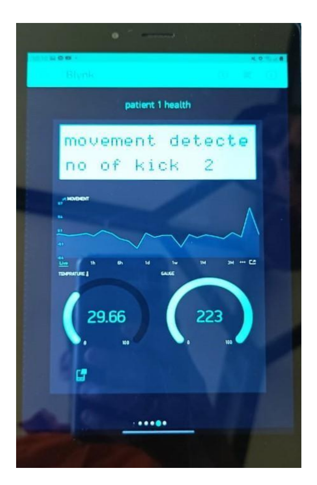
Fig-3: Tested Result