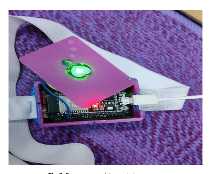
Fig-2: Prototype model containing sensors

The above developed prototype model is going to detect the fetus moments and kicks With the help of accelerometer sensor and gyroscopic, and also detect the heart beat and temperature of the mother using heart beat sensor and temperature sensor. The results from the above sensors are transferred to the cloud, through these readings we can obtain the number of fetal kicks and it's graph, also the temperature of the mother along with the heart beat. From these results we can avoid the fetal and mother death's in rural areas and improve thehealth monitoring system in the rural areas.