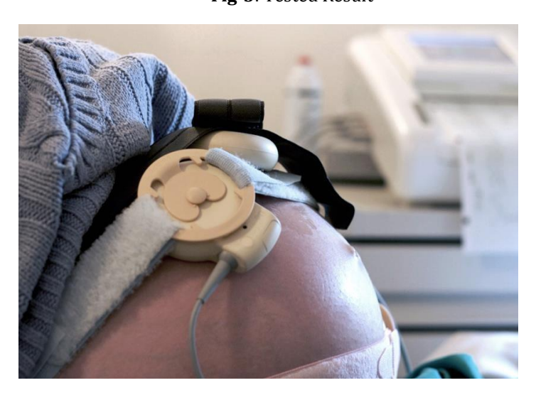
Fig-4: Pregnant women wearing the belt containing sensors