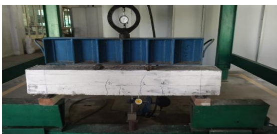
Fig 3 crack in fully wrapped double spaced