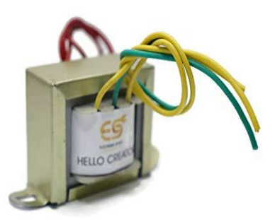
Fig -3: Current Transformer

It is a transformer which is used to decrease or multiply an AC current. It generates the current in its secondary winding which is proportional to the current in its secondary winding.