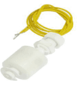
Fig -5: Float Switch

The float switch consists of an empty floating body and an internal switch, also it is called as a sensor. The most common internal change is reed change, so there are also magnets inside the body. It works like a ON/OFF Switching.Therefore, the machine switch creates an open or closed circuit.