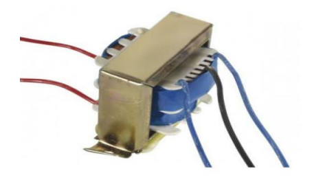
Fig -2: Potential Transformer

A potential transformer is primarily used for the measurement purposes and also it is use for the protection of the power system. An alternating voltage can be measured through the potential transformer. A Center Tapped Step Down Transformer (12-0- 12 500mA) is a common purpose for installing mains transformer. The Transformer has 230V primary winding and double-sided windows in the middle. Transformer has flying connectors with flying colors (Approximately 100 mm long). Transformer acts as a descending transformer reducing AC - 230V to AC - 12V. Transformer provides the output of 12V (12V and 0V). A transformer is a standalone electrical device that transmits energy by inductive integration between its compact circuits. The current fluctuations in the main rotation cause magnetic fluctuations in the transformer context and thus there is a magnetic fluctuation in the secondary turns. This variable magnetic field causes different electromotive forces (E.M.F) or voltage at secondary currents. The transformer has cores made of silicon metal that are very accessible. The metal has multiple access points for free space and the context thus helps to significantly reduce the magnetic field and block the flow in the the path along the coil.