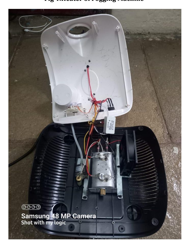
Fig 5: Overall System of Fogging Machine