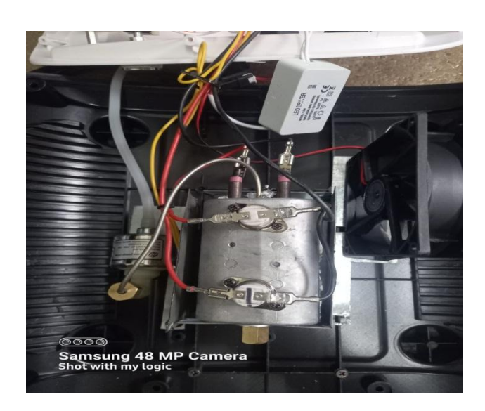
Fig 4:Heater of Fogging Machine