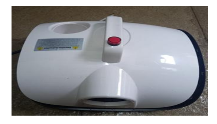
Fig 3:Fogging Machine